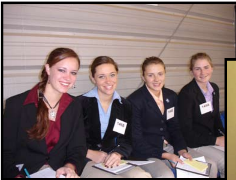
Team on the day of the competition.

Thanks again we could not have done this without the help of WAHA and its generous donation.